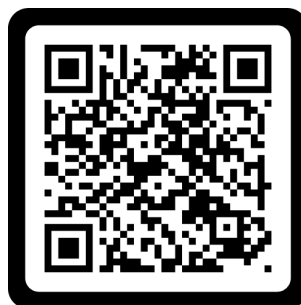
Scan to give via PayPal

Gifts may be designated to the BSO's Endowment Fund which allows the group to "harvest" a percentage of earnings each year. Consider giving an "over and above" gift to the Endowment to honor a musician or loved one, honoring their legacy and supporting the BSO for years to come.