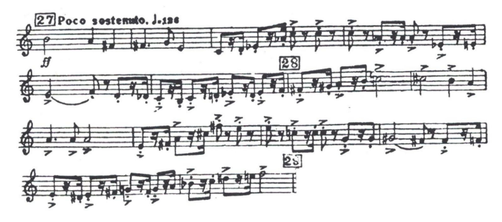
R. Strauss Salome